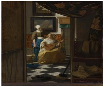
Johannes Vermeer The Lover Letter, c. 1669-70 oil on canvas Purchased with support from the Rembrandt Society

Celebrated artists such as Rembrandt, Frans Hals and Ter Borch created haunting portraits that capture in fine detail the lavish clothing, jewellery and ornate interiors of their patrons. With keen observation, artists Karel du Jardin, Adriaen van Ostade and Johannes Vermeer depicted their own well-appointed studios or created self-portraits, reflecting the rising status of the artist in Dutch society. Jan Steen and Pieter de Hooch created minutely detailed scenes of daily life including humorous and moralizing scenes of children's games or peasants drinking and dancing.