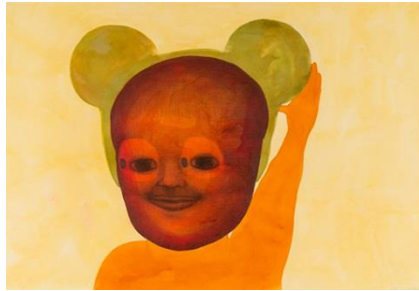
Saskia Jetten April 18-June 22, 2014

Saskia Jetten, Chlor (detail), 2008, watercolour and pencil on paper, 48.6 x 34 cm.